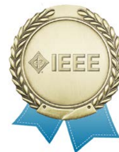
Outstanding Section Membership Recruitment and Retention Performance

For 2017 goals, we reviewed five years of history. Each Section has a unique goal based on different dynamics - whether the Section has had growth or decline, as well as the overall size and location of the Section. Note that reinstatement goals are assigned on the Region level only.